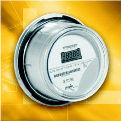
These are the numbers we need from you.

These pictures show the types of meters you may find at your residence. When you read the meter, you will read the numbers from left to right and then write those numbers in the corresponding lines on your billing stub. If no numbers are visible, or they have not changed since the last read, please contact us. If your digital meter flashes all 8's this is a normal display screen to show that all LCD segments are working. It should then flash your kWh and other usage if applicable.